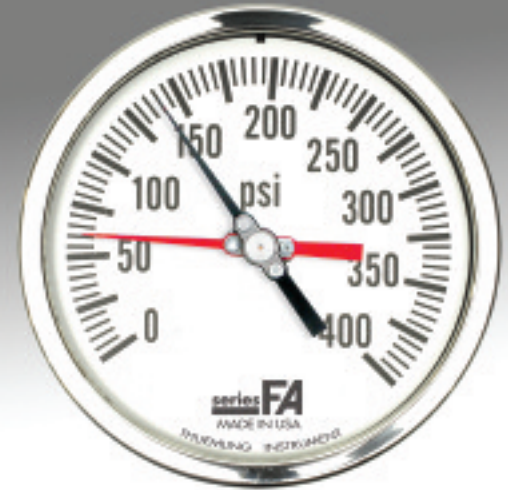
▲ MC6 - 6" LIQUID FILLED MASTER PUMP GAUGE

For applications requiring one gauge to monitor two systems, we offer our liquid filled, panel mounted duplex gauge. KEM-X isolator is standard. Lighted option available. 1.6% accuracy. Range 0-400.