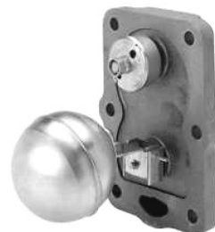
RK2015-3 Repair Kit Head Assembly

Factory preassembled repair kits are available for most B&J models and other manufactures F&T traps. Consult the Factory for selections.