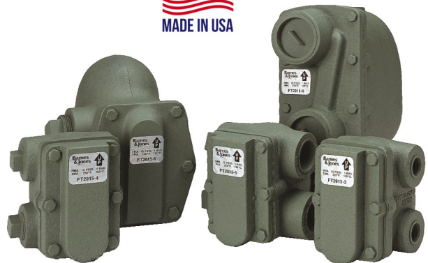
Sizes 3/4” to 2” NPT